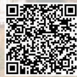
QR Code For Registration